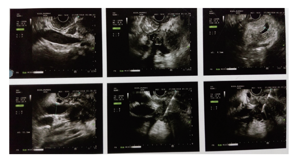
Figure 2. Endoscopic ultrasound (EUS) showing hypoechoic lesion in pancreas head causing dilation of CBD (11.3 mm) and PD (5.3 mm) with compression of portal vein and multiple peripancreatic and perilesional nodes present.

reaction assay is essential for establishing the diagnosis of pancreatic TB [9, 15]. Microscopic features of TB observed on cytology are caseation necrosis, granuloma and presence of acid fast bacilli. However, it must be remembered that bacteriological confirmation may not be possible in many patients [16]. It is also widely accepted that patients with unresectable mass or patients who are poor surgical candidates should undergo FNA before deciding upon radiotherapy or chemotherapy [17]. Histological diagnosis before surgery may alter management of certain disorders like lymphoma, small cell metastasis, and TB which may not need surgery. Isolated primary pancreatic TB diagnosed by EUS-FNA is rarely reported. Centers in tuberculous endemic zone should adopt practice of doing FNA as there are no distinctive clinical, laboratory or radiological features including vascular invasion for distinguishing pan-