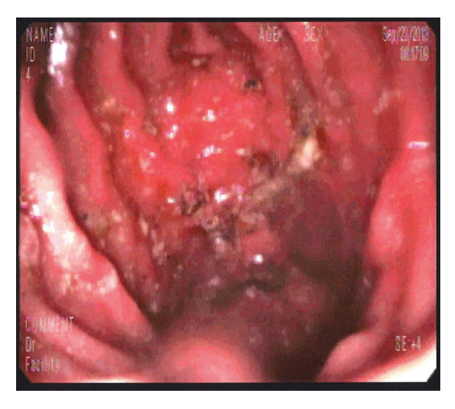
Figure 1. Blood clot just above GE junction with diffuse edema and linear vertical furrows in esophageal mucosa.

posure to an allergen. On the other hand, non-IgE-mediated allergic disorders have a delayed onset of hours or days after exposure to the antigen and potentially more chronic symptoms. The majority of patients with EE have positive skin prick tests, which detect IgE-mediated reactions, and atopy patch tests, which may identify non-IgE-mediated reactions, to foods and/or aeroallergens [2].