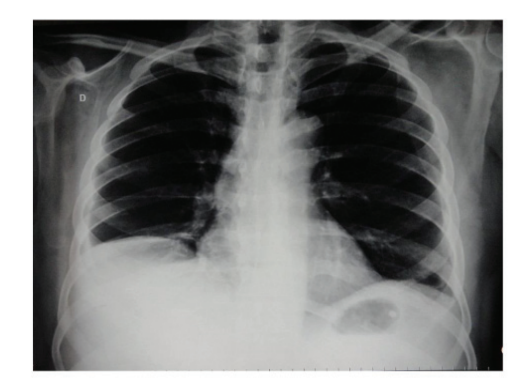
Figure 2.A chest X-ray showing moderate, right-sided pleural effusion.

The patient has been followed on an outpatient basis for