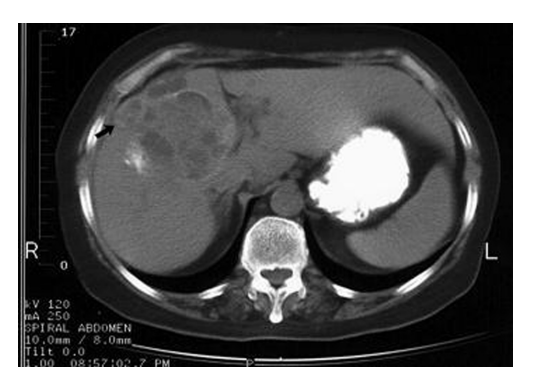
Figure 2. Rupture into biliary tract and subcapsular hepatic space. Change in architecture of the cyst, presence of fluid collection and daughter cysts in the subcapsular hepatic space (arrow) and dilatation of biliary radicles.

The complications of hepatic hydatid cysts are generally rare and they include two main categories: rupture and secondary bacterial infection [1]. Rupture of the hydatid cyst is more frequent, occurring in 20-50% of cases, while the secondary bacterial infection appears in only 5-8 % of cases [6]. Sever-