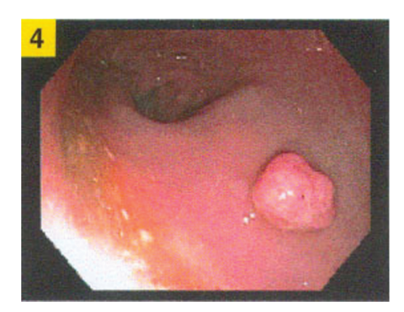
Figure 1. Rectal polyp during colonoscopy.

reproduction in any medium, provided the original work is properly cited