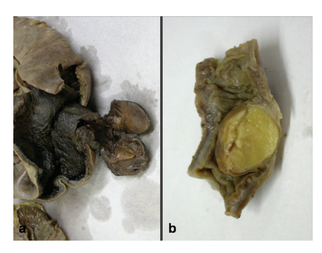
Figure 1. (a) Gangrene intestine with sesile Lipomatous polyp; (b) Submucosal Lipomatous polyp.

A final diagnosis of lipomatous polyp intestine with in-