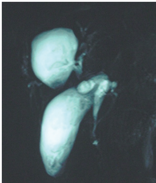
Figure 1. Magnetic resonance cholangiopancreatography revealed 4.5 cm liver cyst in segment IV and V with internal echoes and irregular hyperintensities inside direct communication with right hepatic duct. Common bile duct was dilated with internal debris seen inside. Gallbladder was distended showing irregular linear intensities inside.

with ruptured membranes present, the right intrahepatic duct was seen communicating with cyst cavity. Wide papillotomy was done and plastic stent 10F × 10 cm was placed across papilla. MRCP revealed 4.5 cm liver cyst in segment IV and V with internal echoes and irregular hyperintensities inside seen in direct communication with right hepatic duct. Common bile duct (CBD) was dilated with internal debris seen inside. Gallbladder was distended showing irregular linear intensities inside (Fig. 1).